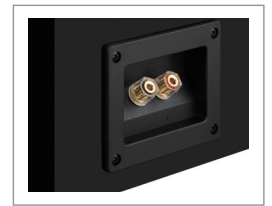
D-175(B) Rear View