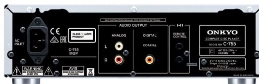
C-755(S) Rear View

Text on components may vary with region.