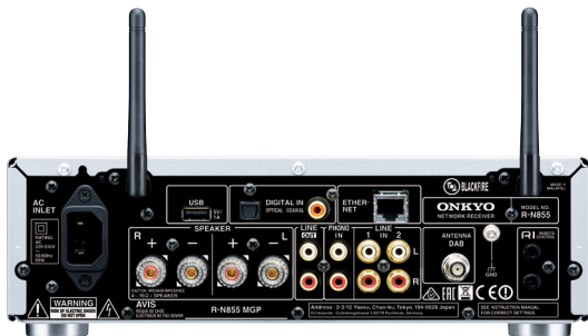
R-N855(S) Rear View

Text on components may vary with region.