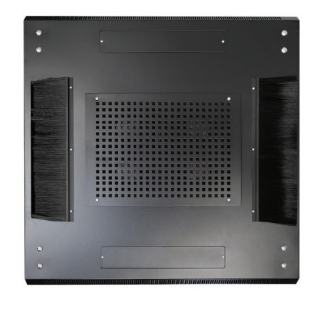
Enlarged Dual Top Brush Cable Entry