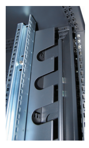
Dual Front Mounted 100mm Hinged Vertical Cable Management Bars