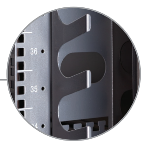
800mm Wide models feature dual front mounted 100mm hinged vertical cable management bars