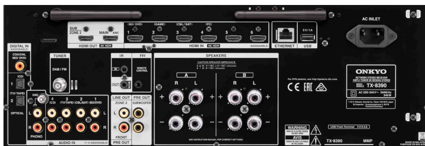
Text on receiver may vary by region.