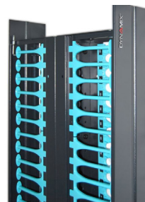
RDF47CM CABLE MANAGEMENT PANELS