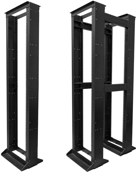
2 POST CONFIGURATION

Elevate your infrastructure with DYNAMIX's RDFSS47U, a cutting-edge Two or Four-Post Steel Seismic Welded Distribution Rack designed to meet the evolving demands of modern data centers and networking environments. From seamless single-rack setups in retail and telecom closets to dynamic, high-density configurations in computer rooms and data centers, DYNAMIX delivers a solution that combines unparalleled cable and connectivity expertise with a focus on ease of installation, effortless MACs (Moves, Adds, Changes), and scalable performance.