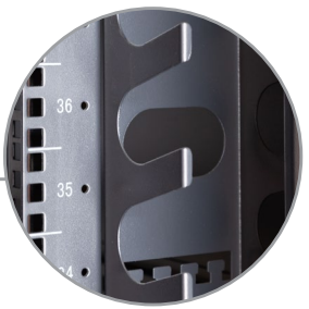
800mm Wide models feature dual front mounted 100mm hinged vertical cable management bars